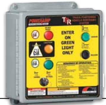
TPR™ shown in with advanced communication controls.